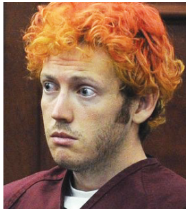
James Holmes killed 12 people and injured 70 others at a Century movie theater in Aurora, Colorado, on July 20, 2012.

PSYCHOTIC EPISODES – Numerous people are experiencing psychotic episodes owing to the high THC content in marijuana. Voices tell them to do heinous acts of murder, and/or commit suicide. Marijuana has been a factor in most mass murders, including Tucson, Aurora, Boston Bombers, Chattanooga and more. Eddie Routh killed American Sniper Chris Kyle and friend after a morning smoking pot. A 23 year old mother in Ohio decapitated her 3 month old baby. Numerous people have committed suicide.